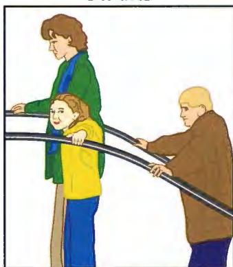
Use the handrails on stairs.