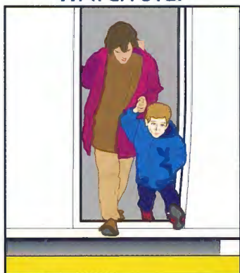
Watch your step carefully between the train and the platform, and assist children when doing so.

assistance if you need help to lift your luggage into the overhead bins.